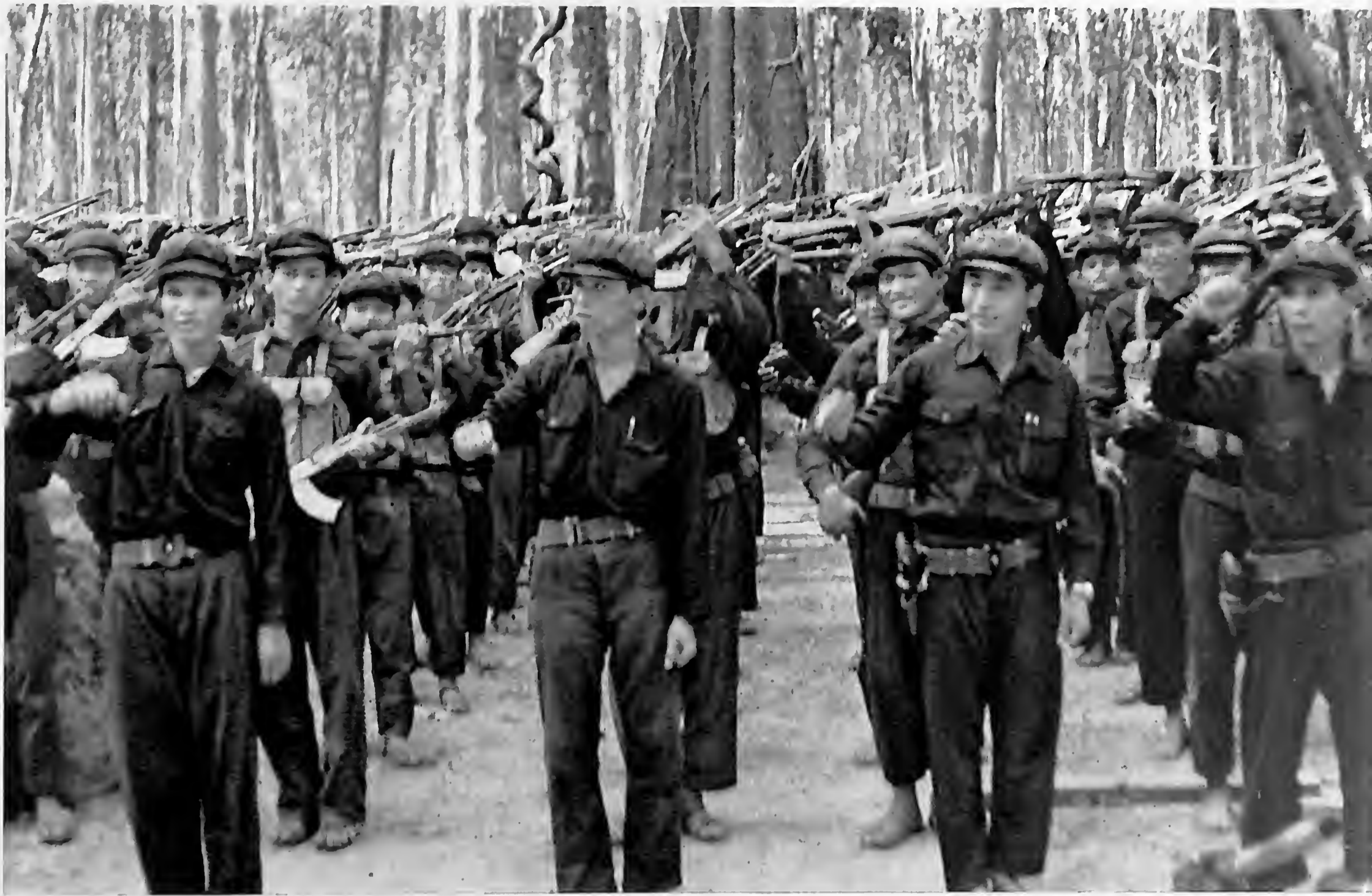
Battle-steeled P.A.F.N.L.C. fighters.